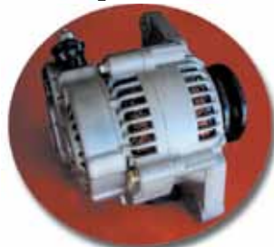
12 volt, 85 amp Super Mini Denso Alternator (A106)