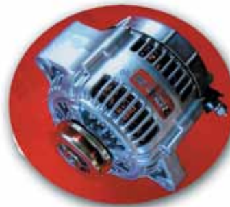
12 volt, 120 amp 1 Wire Denso Alternator (A105)