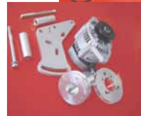
Bolt-On Alternator Kit Chevy, Ford, Mopar, Pontiac, Olds