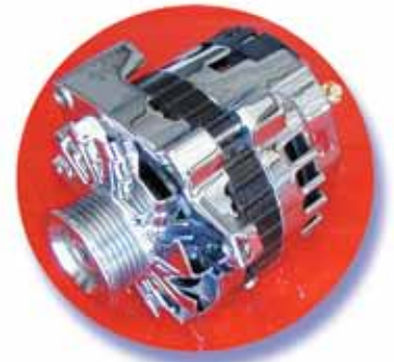
12 volt, 105 amp Mini Chrome 1 Wire Delco Alternator (A103)