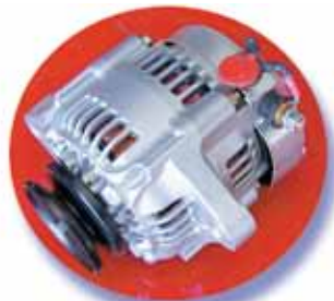
55 amp Supermini Denso 1 Wire Alternator 12 volt, 16 volt, with load dump (A101, A102)